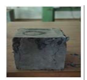
Fig. 2: Failure Pattern