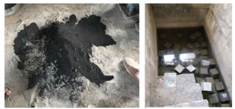
Fig. 1: Mixing of material to prepare the specimens and curing of specimens in tank

After weighing all the material required for preparing the concrete using an electronic weighing balance SCBA, sand, aggregate and cement were blended thoroughly to make uniform mass. The required amount of water was added gradually to make SCBA cement mixture required quantity were added mixing was continued. The mixture was casted into square mould with help of trowel and allowed for 24 h for initial setting. The specimens were removed after initial setting period from the mould and then kept in water tank for curing. Fig. 1 shows mixing of material to prepare the specimens and curing of specimens in tank. Experimental program had curing periods of 7 14 and 28 days.